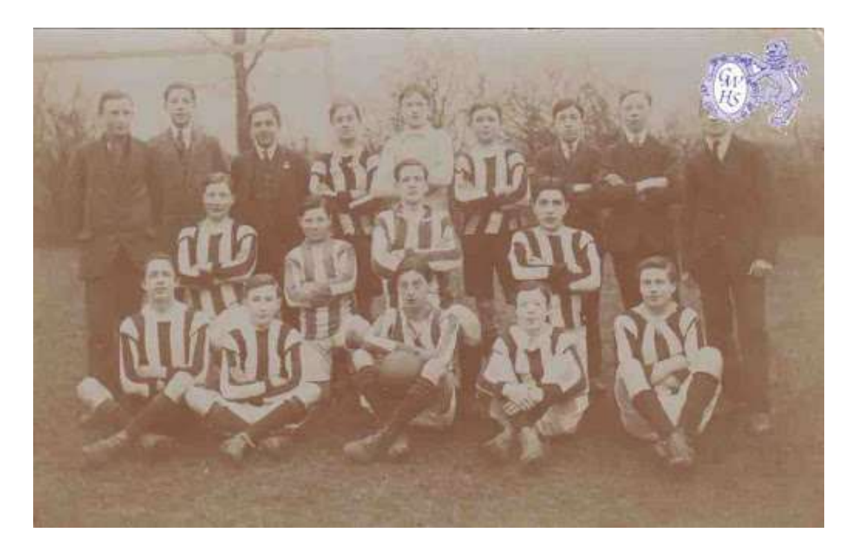
Wigston Adult School Football Team, 1920s

It was situated on Bull Head Street towards the junction with Moat Street on the side of the road that was demolished to make way for the new dual carriageway. All that remains today of this once thriving Adult School are the three photos included in this piece. There are no written records in the Greater Wigston Historical Society's extensive archive, so we are in danger of losing all memory of what was once such an important local institution.